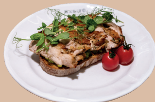
CHICKEN AVO TOAST II 雞肉牛油果烤多士