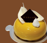
QUINTESSENTIAL CAKE 精選蛋糕