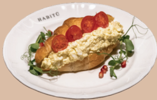
EGG MAYO CROISSANT 雞蛋沙律牛角包 (V)