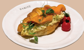
SMOKED SALMON & EGG MAYO CROISSANT 煙三文魚雞蛋沙律牛角包