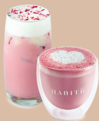
Beetroot Soy Latte good source of immune booster 紅菜頭泡沫豆奶 HOT $56 / ICED $58