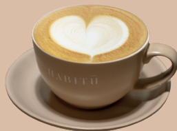
Cappuccino 泡沫咖啡 [30% milk] HOT $48 / ICED $52