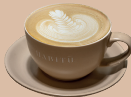
Caffè Latte 鮮奶咖啡 [60% milk] HOT $48 / ICED $52