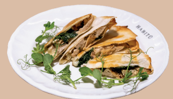
CHICKEN SPINACH QUESADILLA II 菠菜雞肉墨西哥薄餅