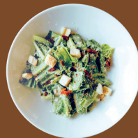
AVO CAESAR SALAD 牛油果凱撒沙律