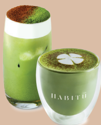
Matcha Soy Latte high in antioxidants 抹茶泡沫豆奶 HOT $56 / ICED $58