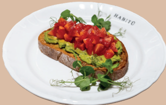
TOMATO AVO TOAST 番茄牛油果烤多士 (V)