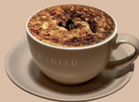
|| Caffè Brulee 薄脆焦糖咖啡 HOT $56