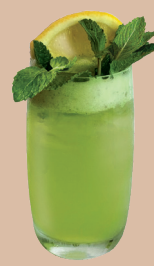
Garden Lemonade fresh garden herbs, mint leaves and lemon slice 檸檬汁、新鮮田園香草、 薄荷葉及檸檬 ICED $56