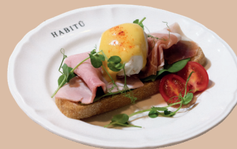
PARMA HAM & COOK HAM EGG BENEDICT 巴馬火腿班尼迪蛋