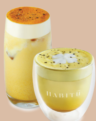
|| Turmeric Soy Latte a natural remedy for flu 薑黃泡沫豆奶 HOT $56 / ICED $58