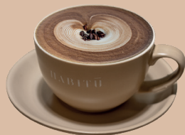
Caffè Mocha 香濃朱古力咖啡 HOT $58 / ICED $58