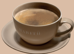
Caffè Lungo / Misto 黑咖啡 / 白咖啡 HOT $44 / ICED $46