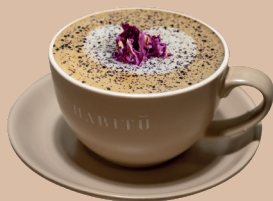
|| Caffè Açai-Rosa 巴西莓玫瑰咖啡 HOT $56 / ICED $58