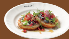
MIXED BERRIES PANCAKE 野莓班戟