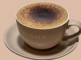
Caffè Muscovado Ginger 黑糖薑汁咖啡 HOT $56 / ICED $58