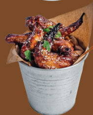
BBQ CHICKEN WINGS 烤焗雞翼

+ $20 add SMOKED SALMON or PARMA HAM 加煙三文魚或巴馬火腿