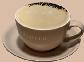
Caffè Earl Grey 伯爵茶咖啡 HOT $56 / ICED $58