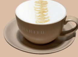
Latte Macchiato 奶泡咖啡 [60% milk] HOT $48