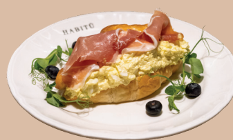
PARMA HAM & EGG MAYO CROISSANT 巴馬火腿雞蛋沙律牛角包