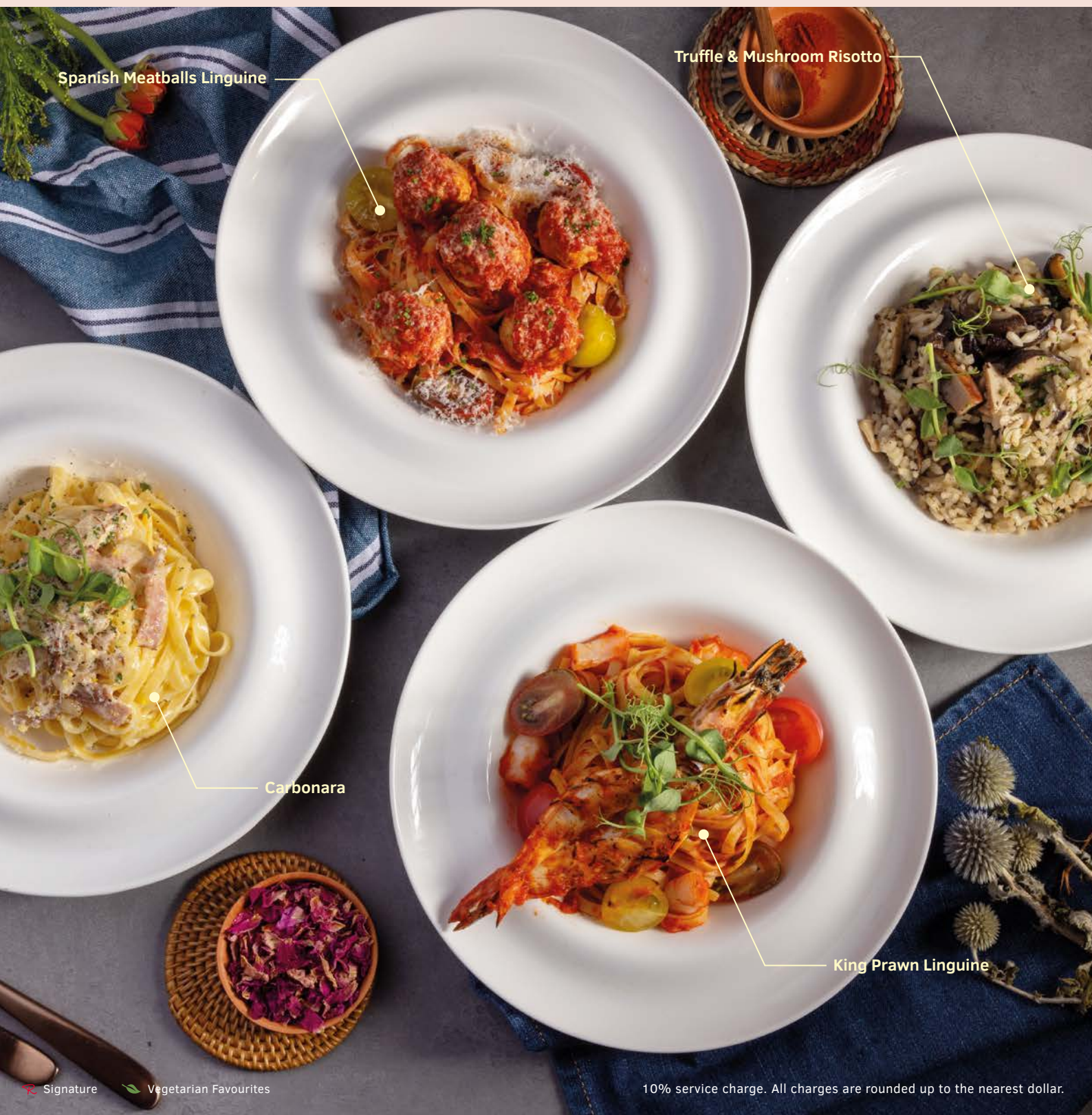
Spanish Meatballs Linguine