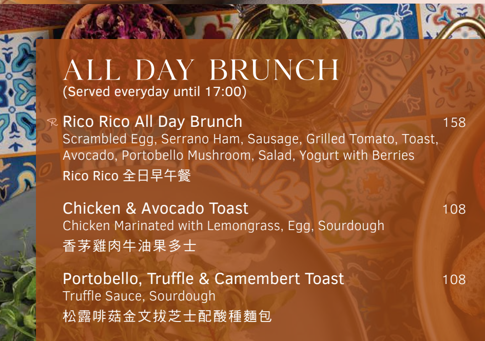
Chicken & Avocado Toast