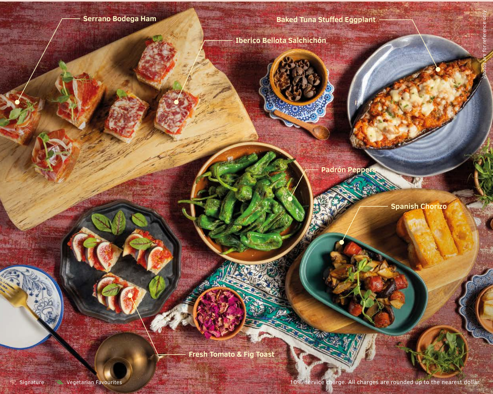
Photos are for reference only